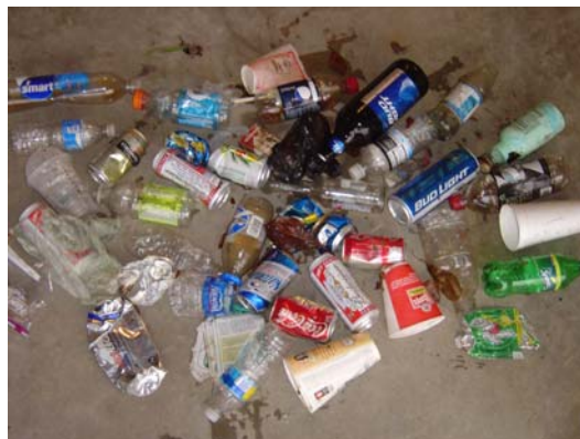
Burlwood & Woodrun area