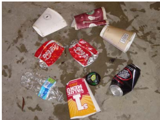
Forestview & Albion area

If you cannot resist the impulse to throw your garbage on our streets, I urge you to sell your house and move to a neighborhood where this is acceptable behavior. You are ruining the property values in our community.